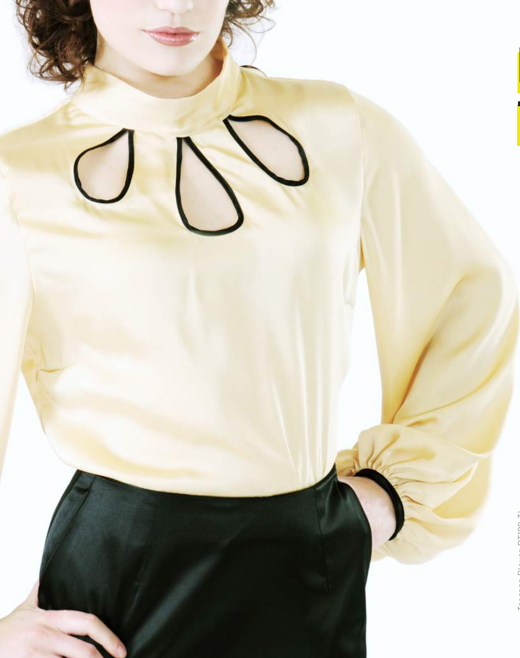
Toscana Blouse RT189-TI Poppy Skirt RT188-TI