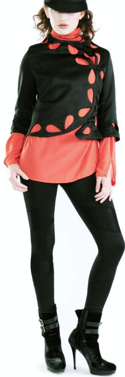
Forget Me Not Jacket RT087-TI Razor Leggings RT168-TI