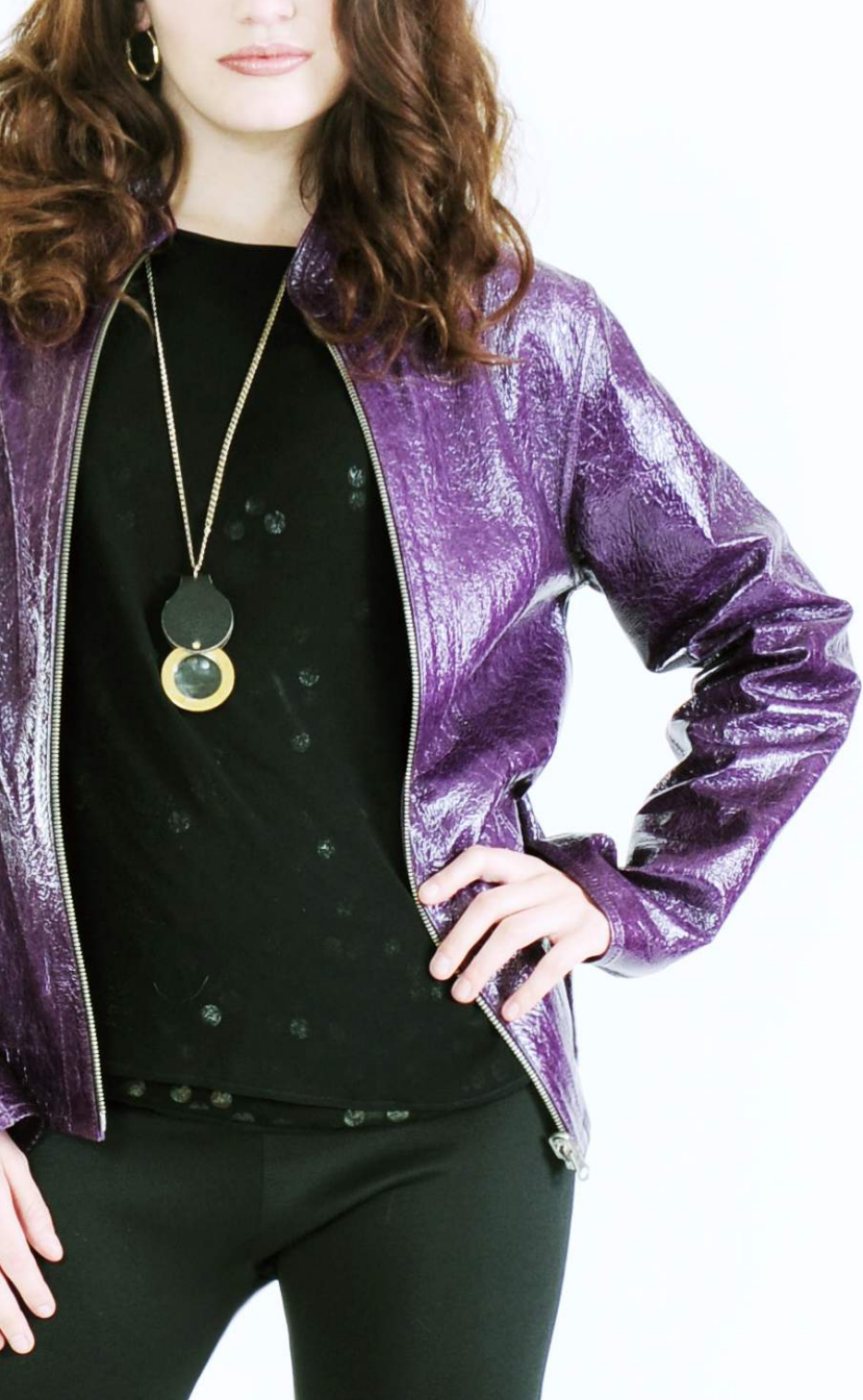
Sleek Flip Jacket RT088-TI